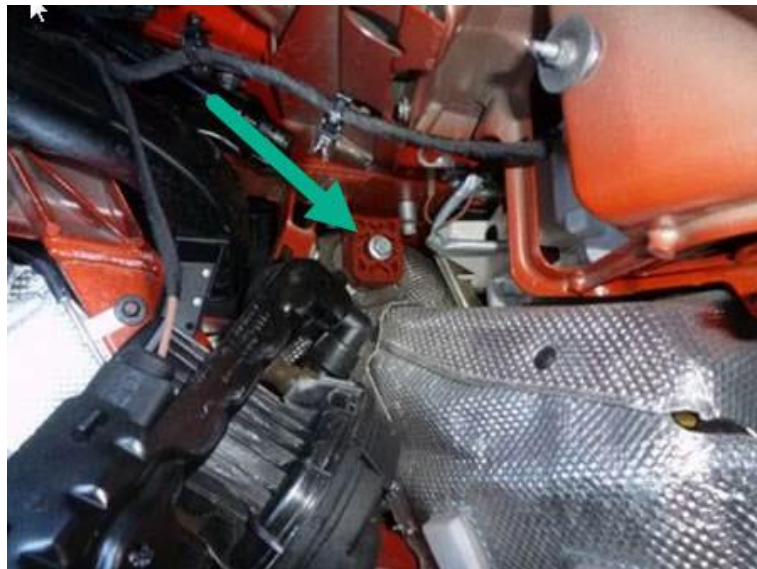
Figure 2. Bracket for exhaust system.

If the concern is caused by the washer, replace the washer on both sides of the muffler (Figure 2).