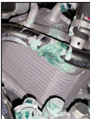
(View looking up from the bottom of the vehicle)

Dealers have reported coolant leaking from the water hoses at the CVT8 fluid cooler (see photo below). Normal dealer repairs have been to replace the water hose and/or clamps on the affected area.