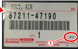
1 Packing Serial Number