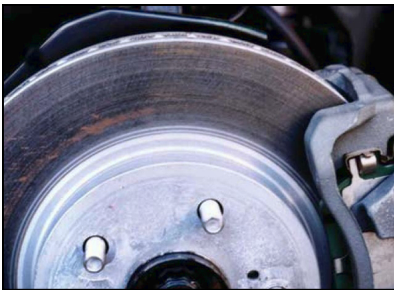
Figure 1. Slight Rust on Rotor (Easy to Remove by Braking)