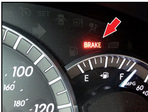
Figure 1. Condition 1: Brake Warning Light