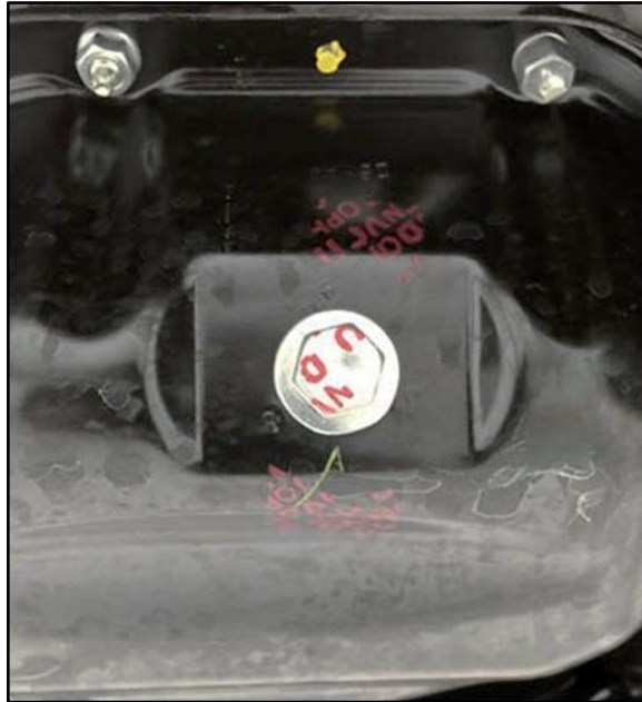
Figure 2. Indication of Inspection Label Removal