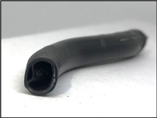
Restricted Fuel Line

Begin by checking the fuel pressure at the low pressure pump fuel output line (A, page 2) in the fuel tank using a fuel gauge kit, tool number: FPG2200. The gauge should display above the PSI shown in the table below if the low pressure fuel pump functions correctly.