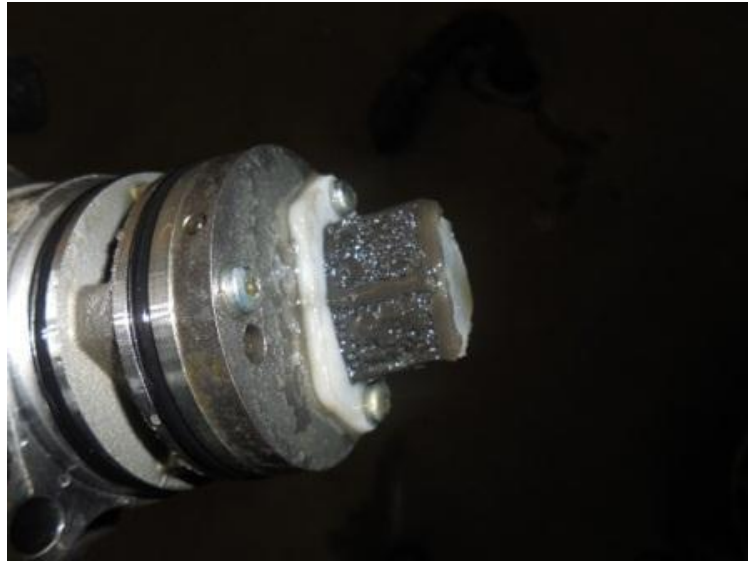
Figure 1. Strainer of pump for four-wheel drive clutch.