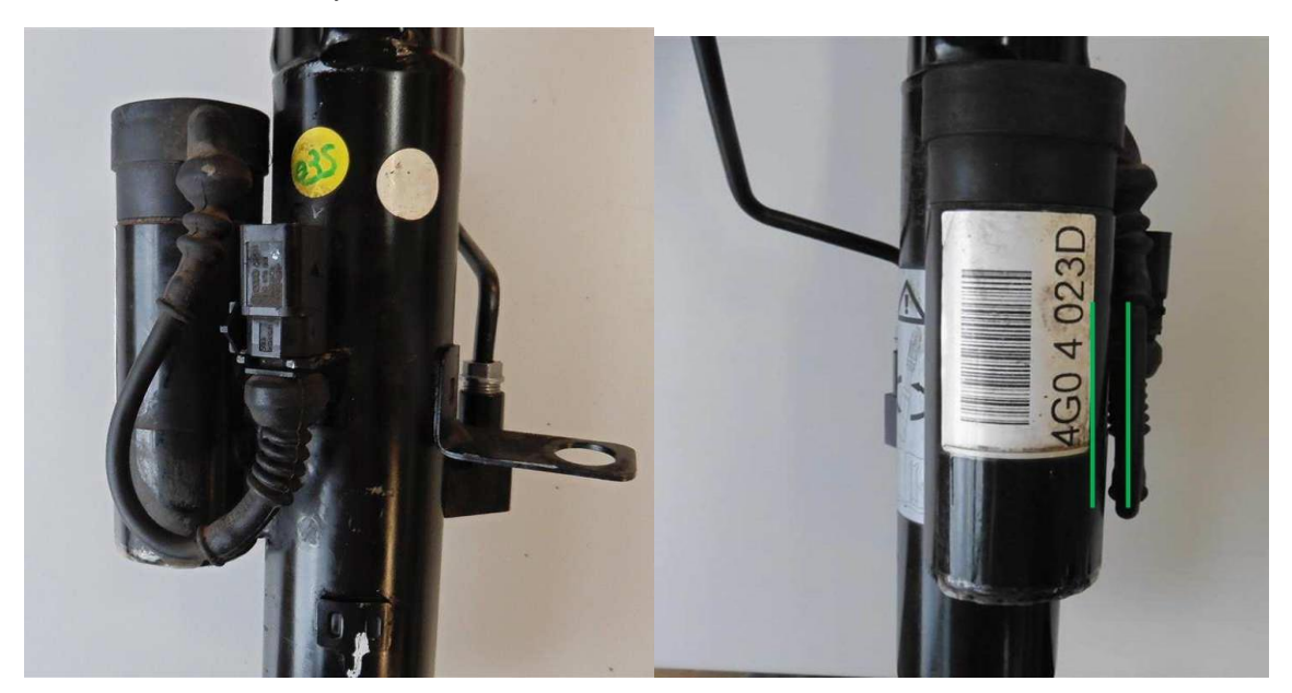
Figure 2. Correct connector alignment and cable routing.