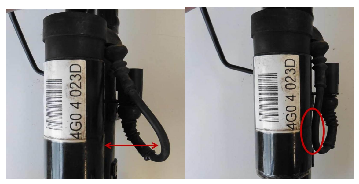
Figure 3. Twisted cables.