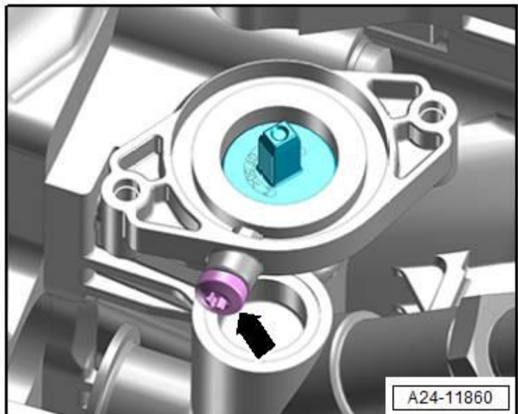
Figure 1. Micro-encapsulated bolt (A24-11860 of repair manual).

Tip: The engine does not have to be removed.