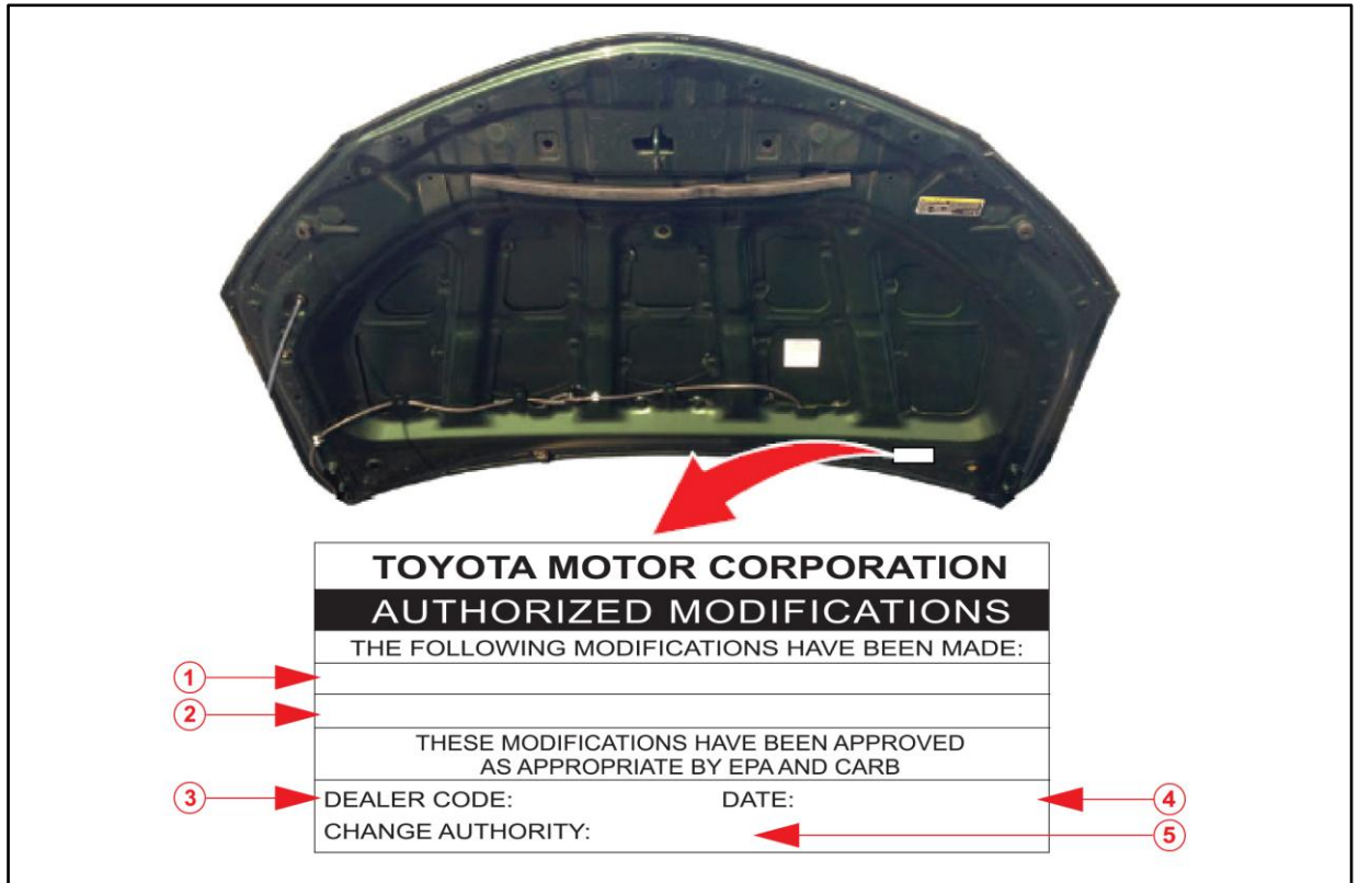
Figure 1. Location of Authorized Modification Label for 2014 – 2016 Corolla