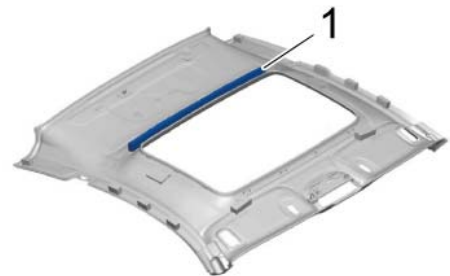
Plastic foam strip