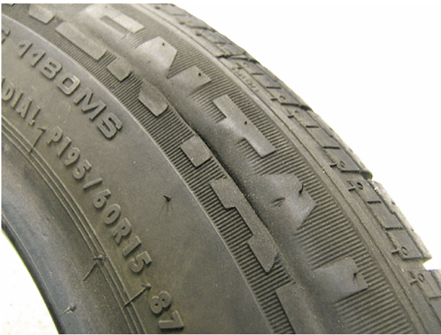
The above tire shows sidewall wear extending completely around the tire. This damage is the result of extended driving on a tire that is completely flat. The extensive sidewall wear is from contact with the road at that point.