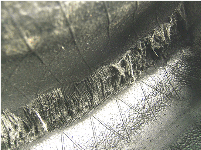
This tire was damaged by extended driving with little or no air, just as the tire above it was. This photo shows the inside view. Shredding of the inside may not always be accompanied by obvious exterior damage.