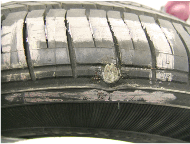
This tire was returned for air leakage. The source of the air leakage is a tire plug installed in a non-approved portion of the tire. This tire has been damaged by a road hazard and does NOT exhibit a warrantable condition.