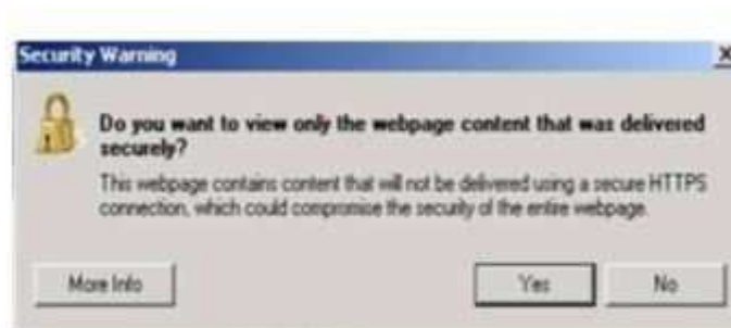
Fig. 2 Pop-up Security Message

NOTE: A blank USB flash drive must be used to download the software. Only one software update can be used on one USB flash drive.