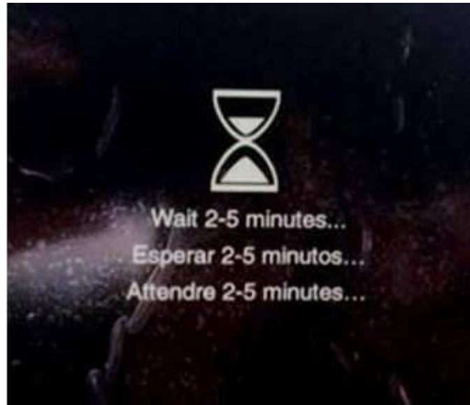
Fig. 3 Hourglass Screen

NOTE: **During the update process you will see multiple hourglass and “Please Insert Update USB” screens for extended periods of time (several minutes) (Fig. 3) or (Fig. 4) . DO NOT remove the USB flash drive at this time. Only remove the USB flash drive when the update has completed, when the screen displays the software levels again. The screen will say “Software updated successfully”.**