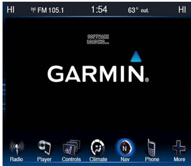
Fig. 10 Garmin software loading

CAUTION: Do not interrupt the software update process once it has begun. It may cause permanent damage to the radio which will require replacement.