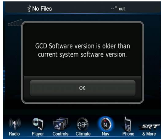
Fig. 8 Garmin Software Already Updated