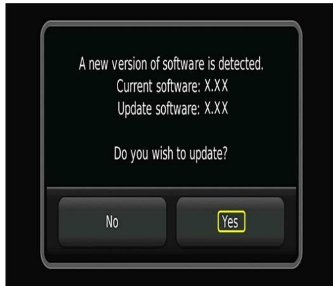
Fig. 9 Garmin Software Needs Updating