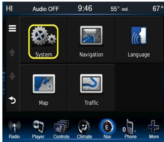
Fig. 6 System Icon

19. Press the About screen icon, see (Fig. 7), and record the software version.