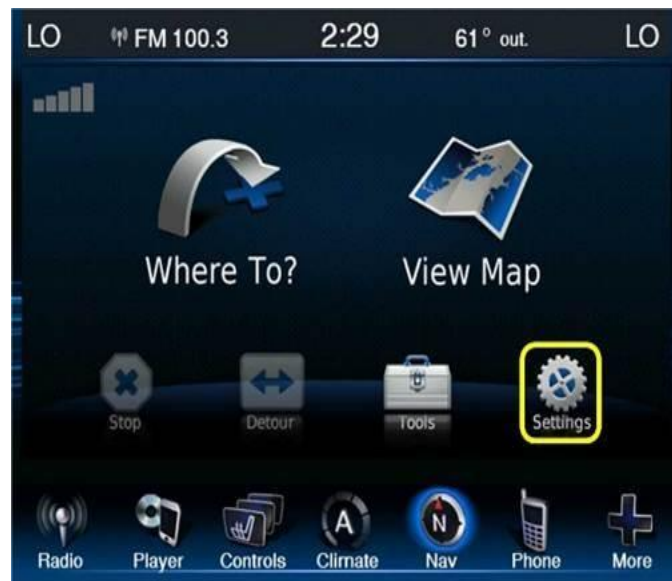
Fig. 5 Settings Icon