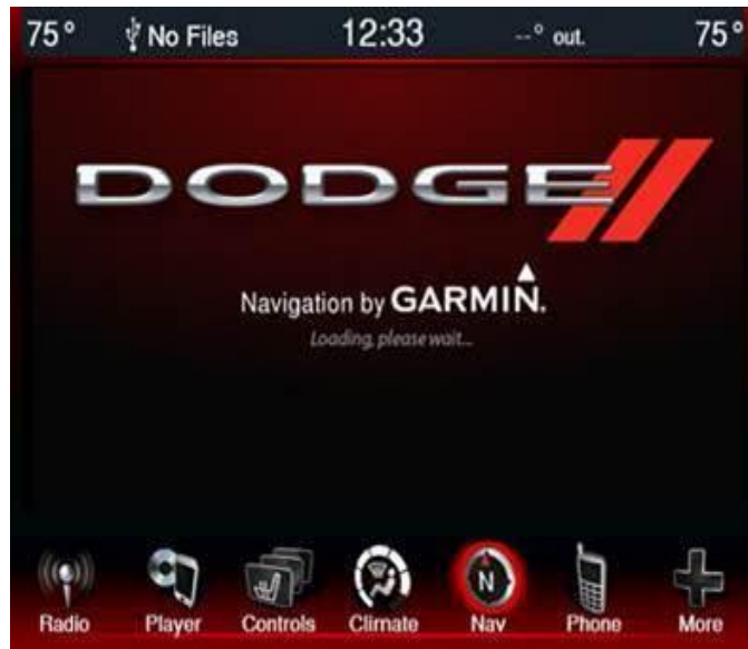
Fig. 1 System Loading Screen