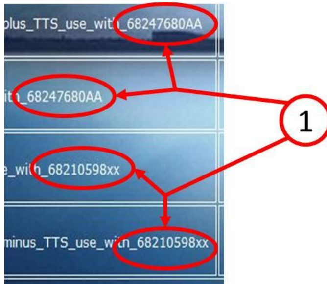
Fig. 4 Radio Software Selections