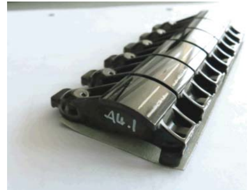
Marking valve levers

References: ⇒ Workshop Manual '158219 Removing and installing cylinder head cover' ⇒ Workshop Manual '282020 Removing and installing ignition coils' ⇒ Workshop Manual '287020 Removing and installing spark plugs'