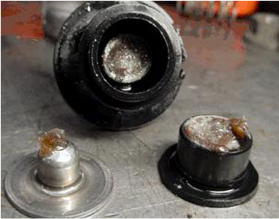
LGH/LML Fuel Pressure Regulator 1 Contaminated With Diesel Exhaust Fluid (DEF)