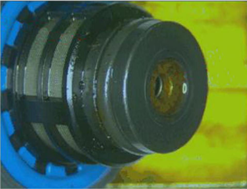
LGH/LML Fuel Pressure Regulator 1 With Rust Due To Water Contamination