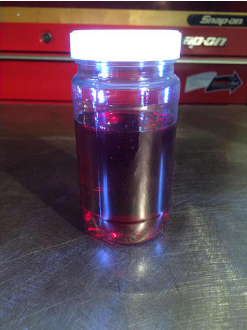
Diesel Fuel and Transmission Fluid