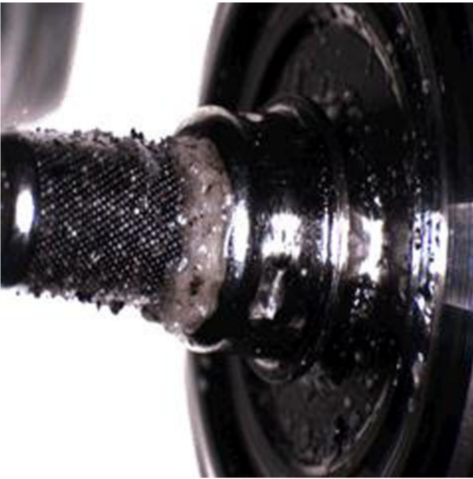
LGH/LML Fuel Pressure Regulator 2 With DEF Contamination