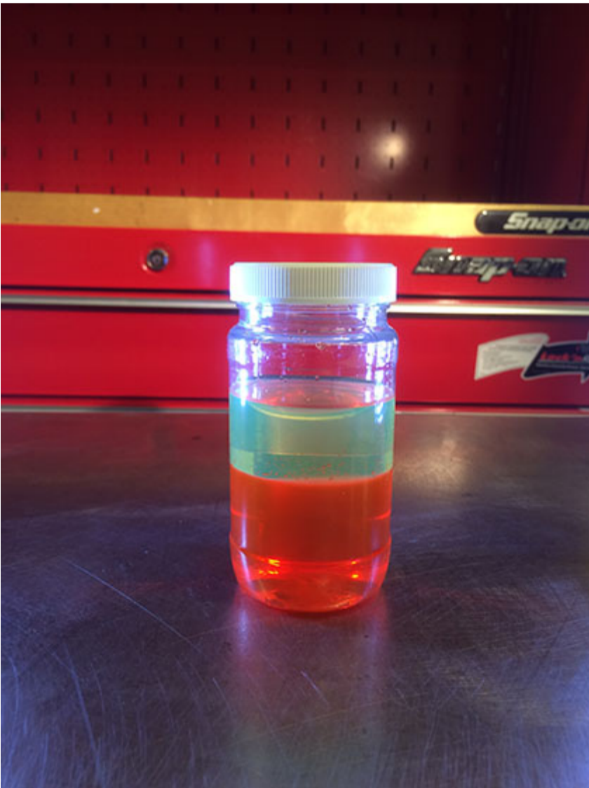
Diesel Fuel and Coolant