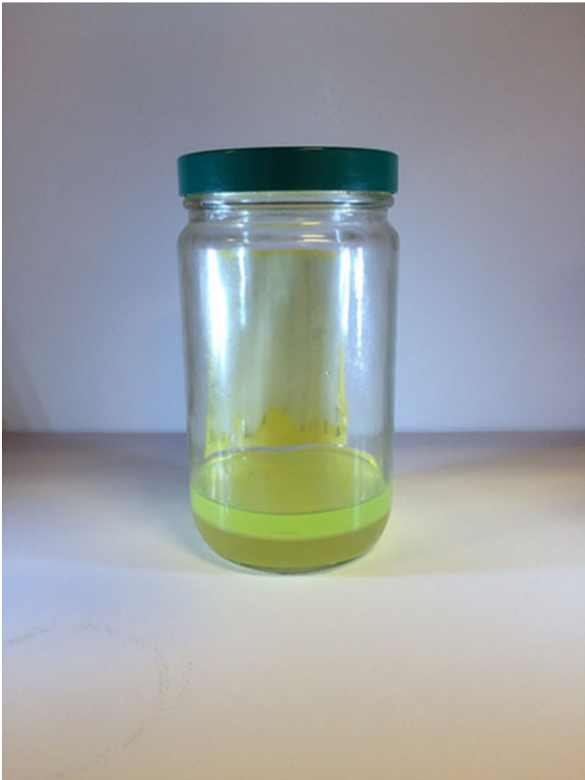
Diesel Fuel and Water