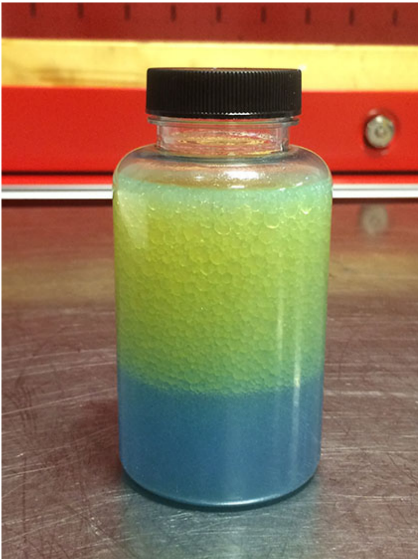
Diesel Fuel and Windshield Washer Fluid