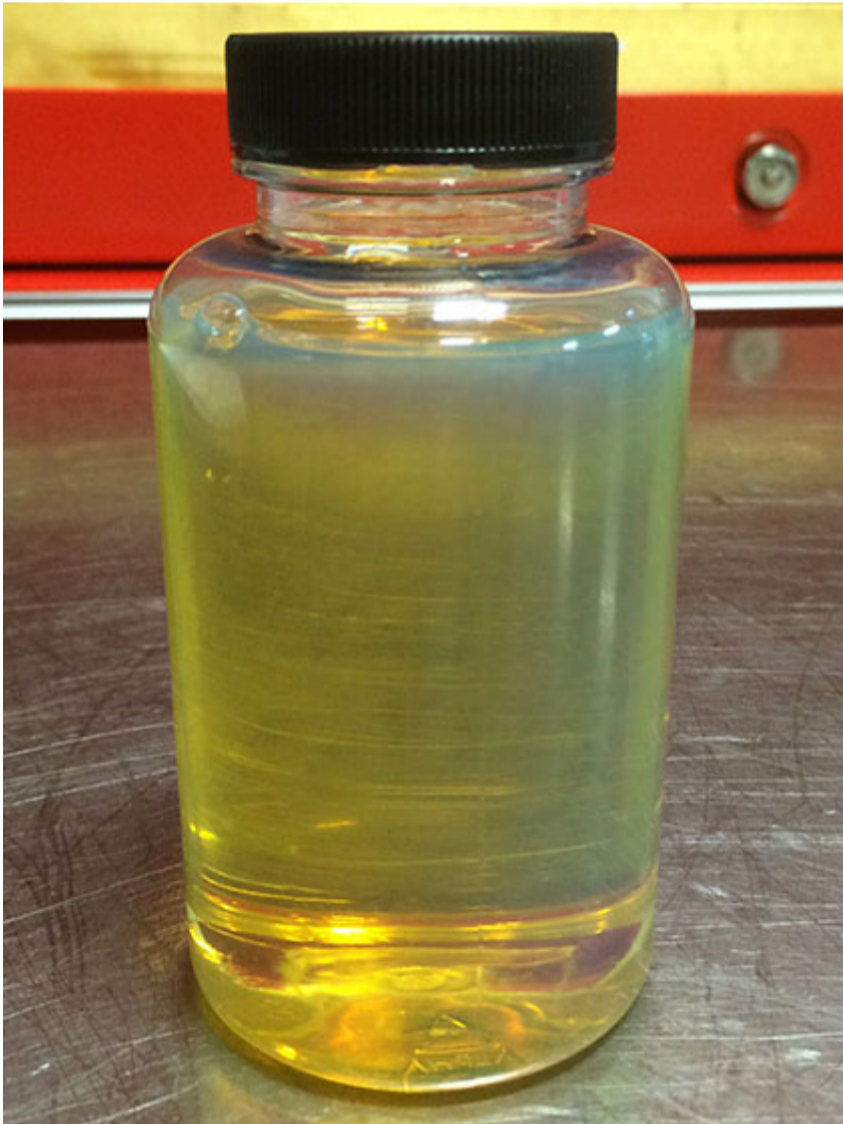
Diesel Fuel and Power Steering Fluid