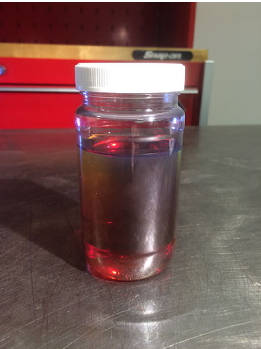
Diesel Fuel and Engine Oil