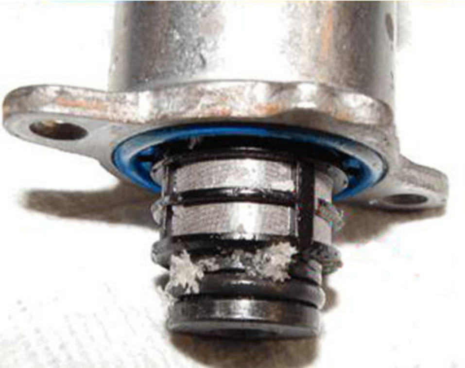
LGH/LML Fuel Pressure Regulator 1 Contaminated With DEF