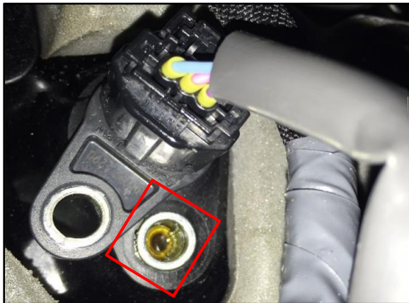
Figure 3. Engine Oil in Cam Sensor Bolt Hole (Bolt Removed)