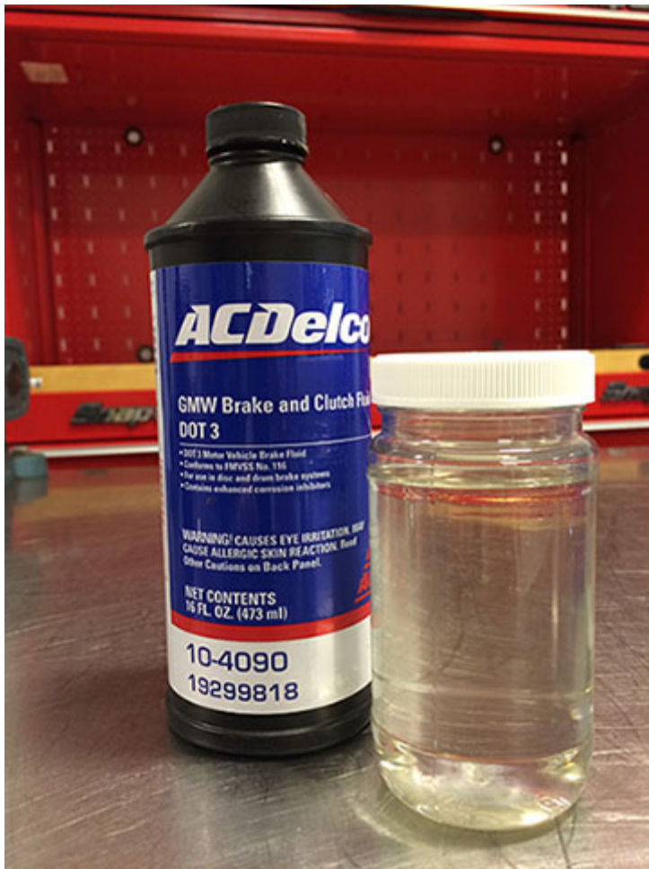
Diesel Exhaust Fluid (DEF) mixed with Brake Fluid.