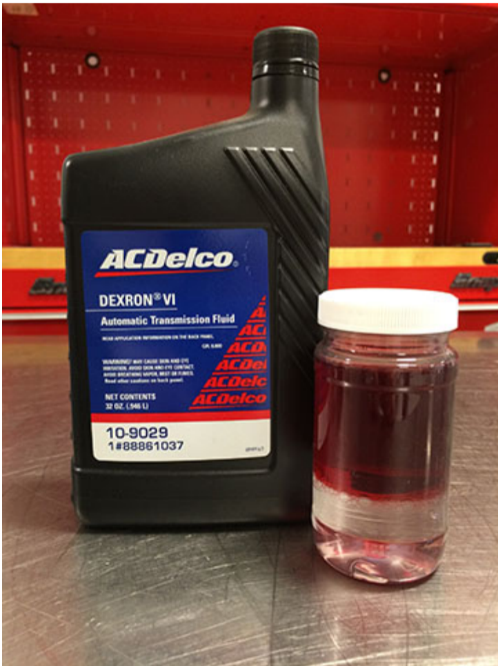
Diesel Exhaust Fluid (DEF) mixed with Transmission Fluid.