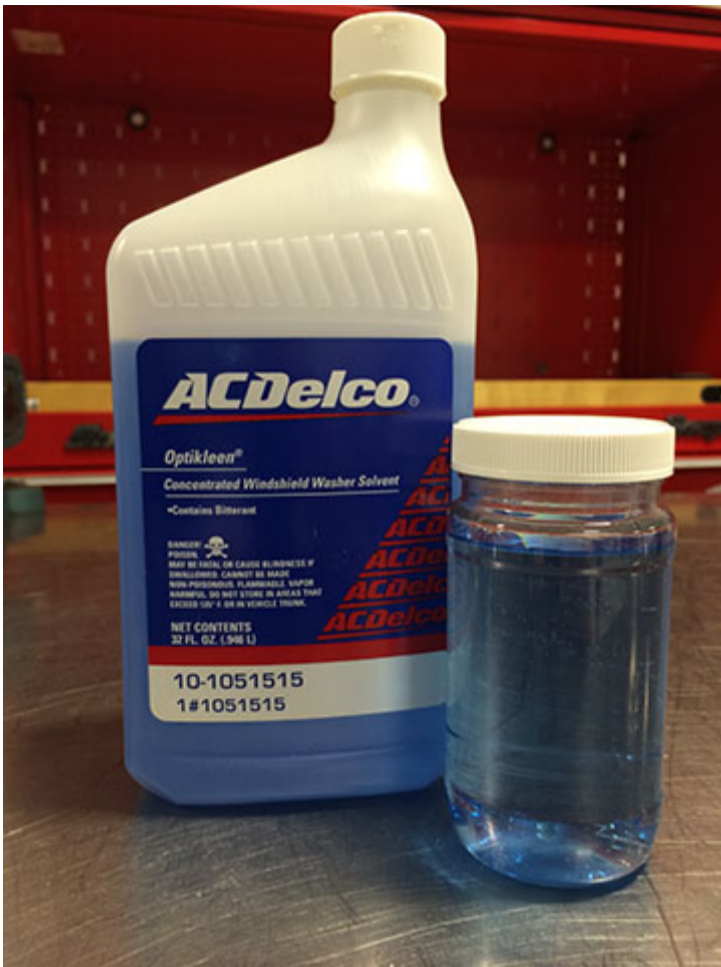
Diesel Exhaust Fluid (DEF) mixed with Windshield Washer Fluid.