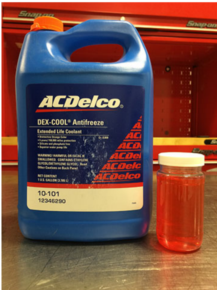
Diesel Exhaust Fluid (DEF) mixed with Dexcool.