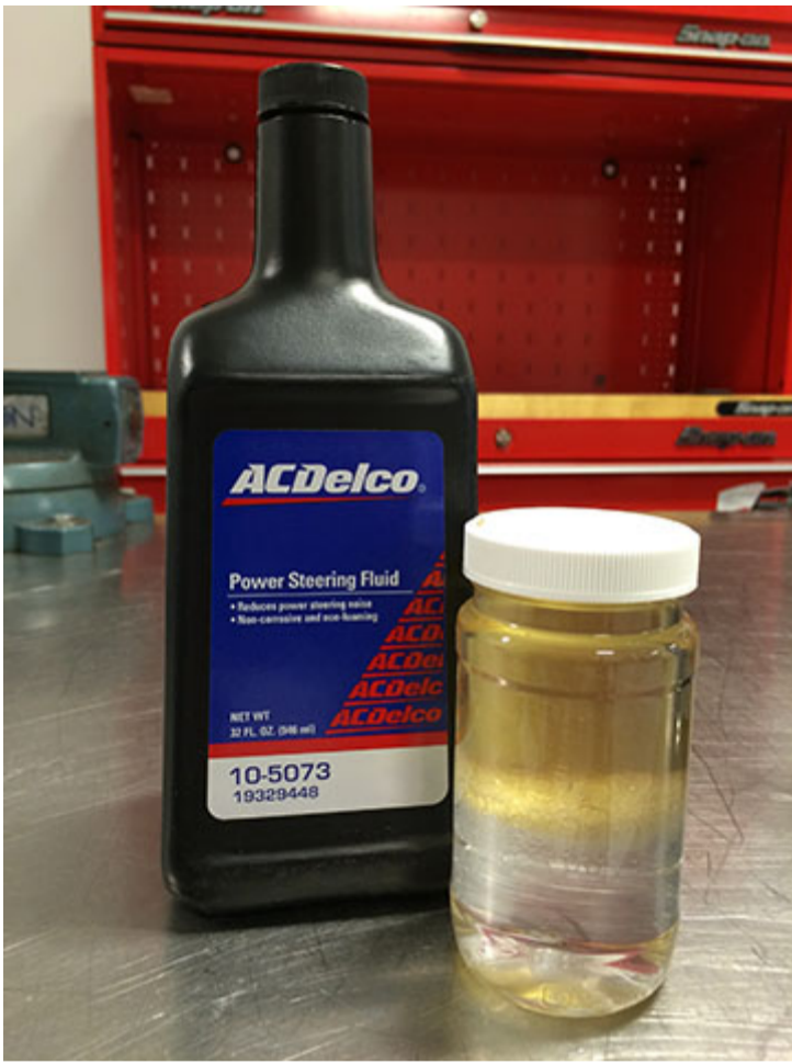
Diesel Exhaust Fluid (DEF) mixed with Power Steering Fluid.