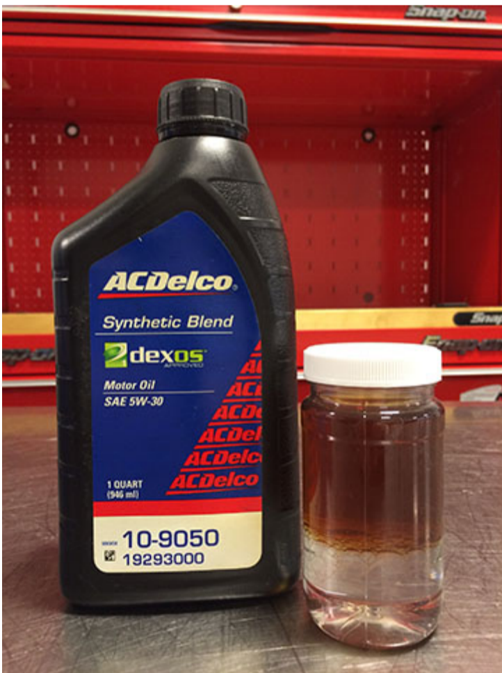
Diesel Exhaust Fluid (DEF) mixed with Engine Oil.