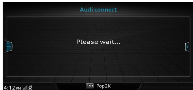
Figure 1. "Please wait..." message.