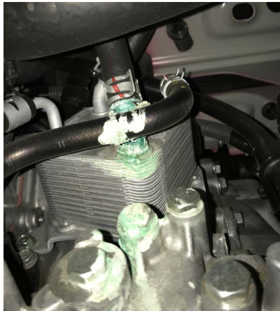
(View looking up from the bottom of the vehicle)

Dealers have reported coolant leaking from the water hoses at the CVT8 fluid cooler (see photo below). Normal dealer repairs have been to replace the water hose and/or clamps on the affected area.