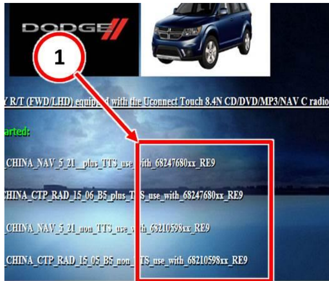
Fig. 3 Uconnect Main Portal Screen