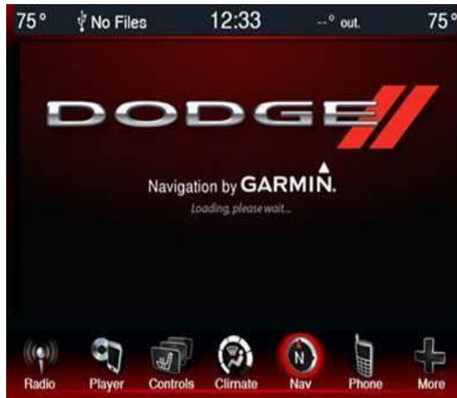
Fig. 1 System Loading Screen