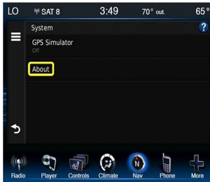
Fig. 7 About Icon

20. Press the About screen icon, see (Fig. 7), and record the software version.