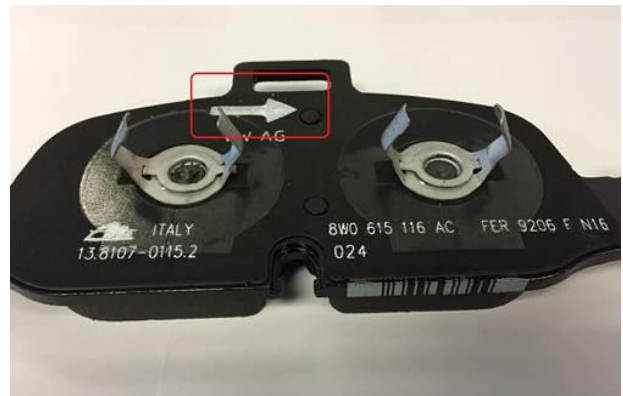
Figure 4. Arrow showing correct installation direction.