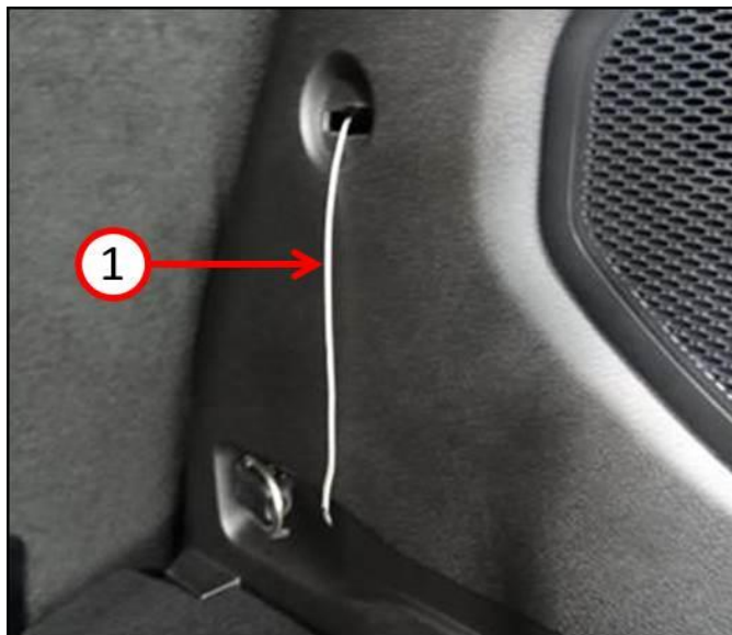
Fig. 2 Loose Cable