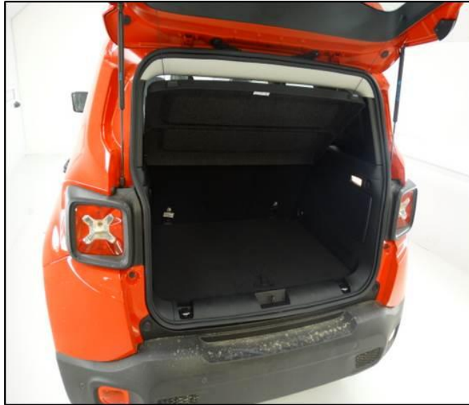
Fig. 1 Rear Hatch