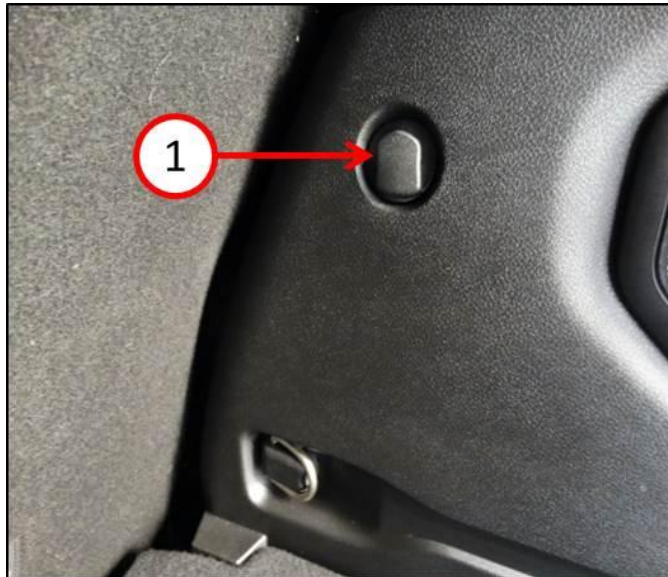
Fig. 6 Cover Installed