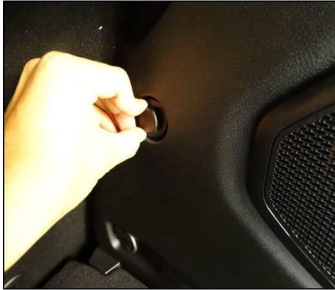
Fig. 5 Installing Cover