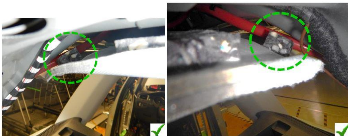
Figures 6 and 7, Rear drain hoses routed behind foam blocks on headliner.

3. Reinstall the headliner ensuring the foam blocks do not contact either of the sunroof drain hoses (See Figures 6 and 7).