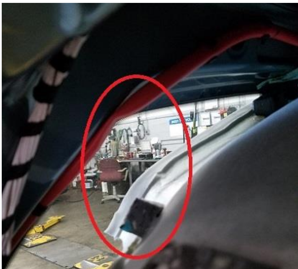
Figure 1: Sunroof drain pinched by foam block on headliner

The rear sunroof drains may be pinched shut by foam blocks on the headliner, not allowing the sunroof frame to drain properly (See Figure 1).