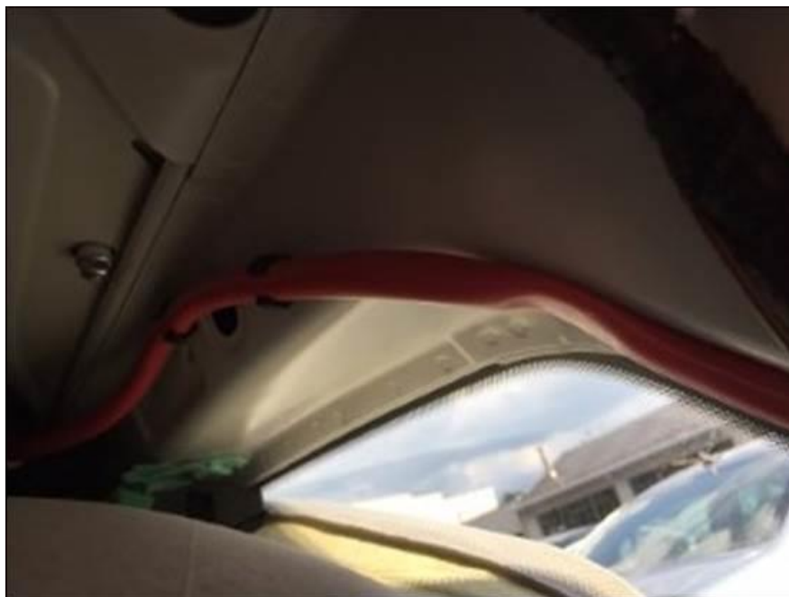
Figure 3: Impression on rear sunroof drain from contact with headliner foam block.

Care must be taken when working with the headliner. The headliner bends easily. Damage to the headliner during this repair is not covered by warranty. Replace the headliner if it is bent.