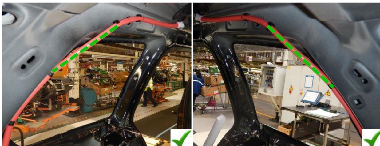
Figures 4 and 5: Correct routing of left and right rear drain hoses with no slack between the 2 nd and 3 rd mounting clips.

The new hoses (longer than original) should be cut to match the length of the original hoses prior to the installation. During installation of the new drain hoses, ensure the hoses are pulled taught between the 2 nd and 3 rd mounting clips with no excess slack in the hoses (See Figures 4 and 5).