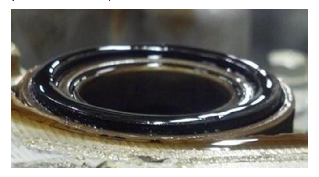
This is an example of a new seal