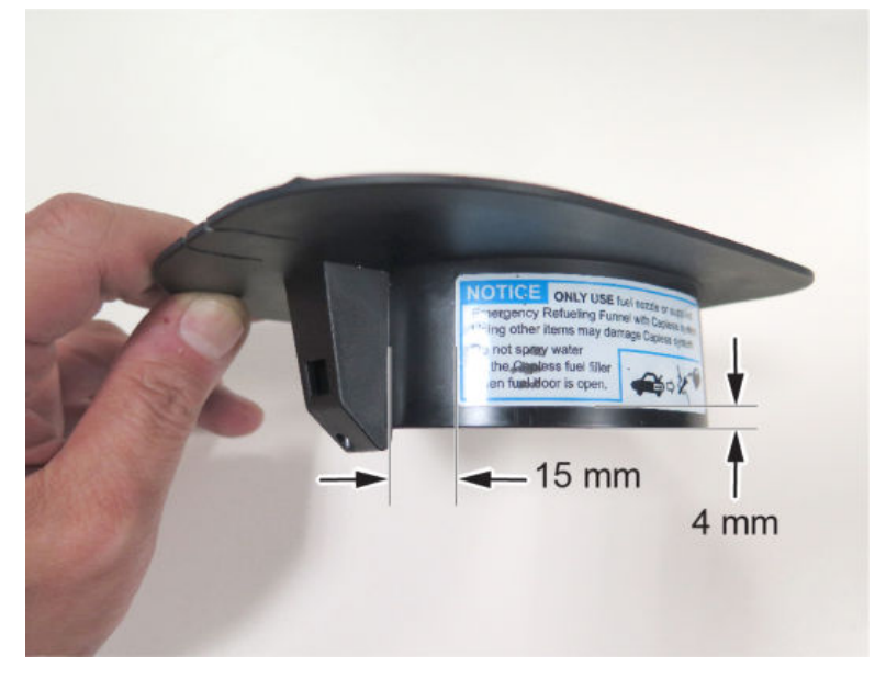
P/N 17669-R9S-A10 (Fuel Filler Caution [Unleaded Fuel Only])