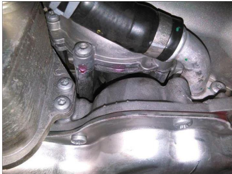
Figure 4. Coolant marks on flange of thermostat housing.