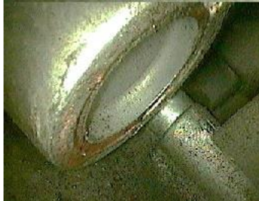
Figure 3. Coolant marks on flange of coolant pump housing.