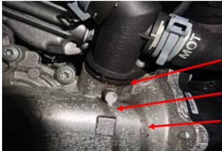
Figure 6. Areas where coolant marks can be found.