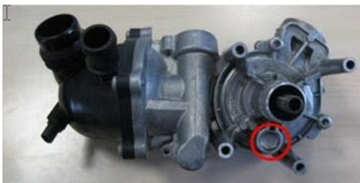
Figure 2. Coolant marks in plug of coolant pump housing.