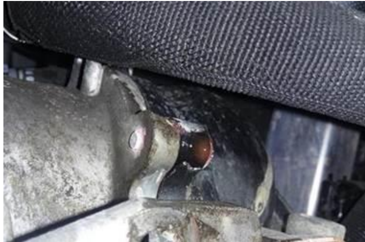
Figure 5. Coolant marks on coolant connector union.