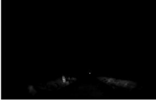
At night with no traffic light