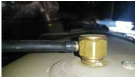
Fuel tank connection

3.2.2. Take pictures of the vent filter hose connection at the filter housing and at the fuel tank. An example of the pictures required can be seen below: