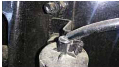
Filter housing connection

3.2.3. Attach the pictures to the eService case.