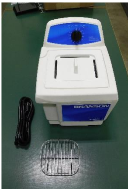
Figure 1 – Essential Tool – DPF Injector Cleaning Kit - ultrasonic cleaner, and support rack (EN-52575)

DPF Injector Cleaning Kit EN-52575, DPF Injector Cleaner Accessory Kit EN-52575-50, and Injector Seal Installer and Sizer J-46911 combine to make a complete kit for cleaning. The essential tools are used on a bench top (see Figures 1, 2, & 3). Refer to the appropriate service manual for information on when and how to perform the DPF Injector Cleaning procedure.