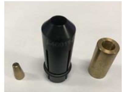
Figure 3 – Essential Tool – Injector Seal Installer and Sizer Kit - seal protector, seal pusher and seal sizer (J-46911)