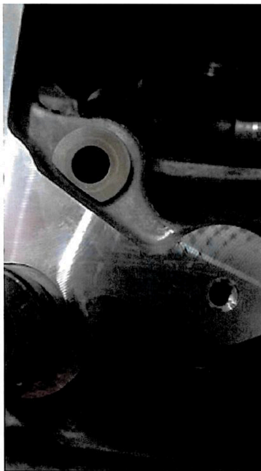
Figure 2 – New Steel Bushing Installed

In the Detroit Transmissions Manual (DDC-SVC-MAN-0140), reference the chapter titled “Internal Component Repair” and section “Split Rod Bushing Repair”. A supplemental video can be found on ddcsn.com . Go to Support, then Multimedia, then DT12 Transmission, then Split Pin Bushing Repair. See Figure 2 for the new bushing installed in a transmission. Note how the cut side of the bushing matches up with the transmission housing.