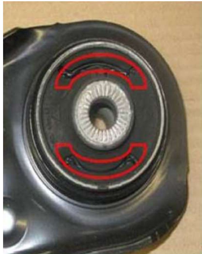
Figure 3. Lithium grease is applied on the red highlighted area only.

The lithium grease must only be applied to the areas shown in red (Figure 3).