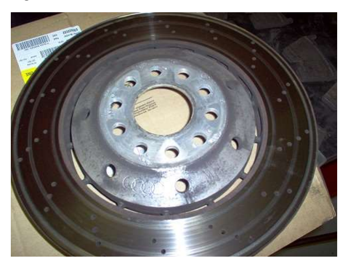
Figure 2. Grooved disc.