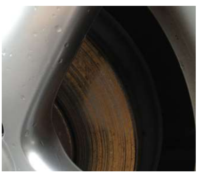
Figure 1. Disc covered with rust.

5. Discs are covered with rust. Rust can form when the vehicle has not been driven for a long period of time (Figure 1).