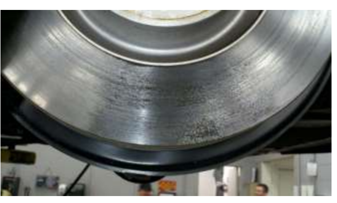
Figure 5. Brake pad material has transferred to the discs.

There are "pad marks" on the brake disc as a result of brake pad material transferring to the discs (Figure 5). Pad marks can occur when a vehicle has been parked for long periods of time in a wet or snowy environment.