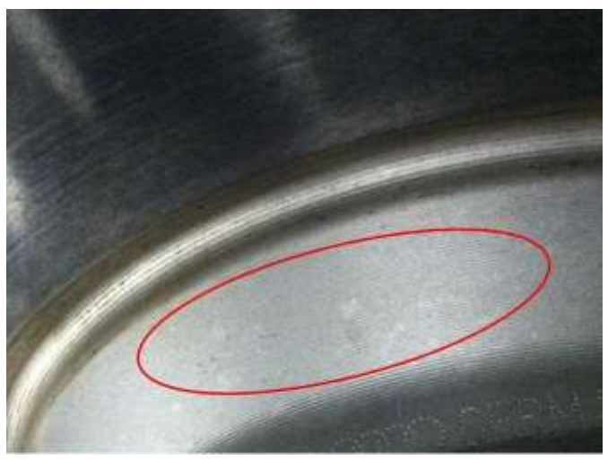
Figure 4. Small spots and discoloration due to chemical contamination from cleaner that was sprayed directly onto the disc.