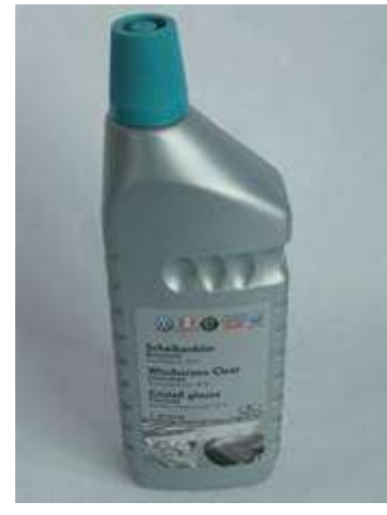
Figure 5. G 052 164 M2 windshield cleaner concentrate with anti-freeze.

5. Refill the reservoir with the correct type and concentration of solvent. Windshield cleaner concentrate with anti-freeze G 052 164 M2 works best (Figure 5). This solvent can be adjusted for freeze protection to -70° C (-94° F), prevents washer jet contamination particularly on the "fan" type of washer jet, and is highly effective in removing residues and insects from the windshield.