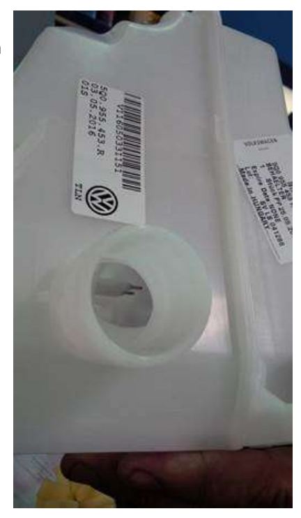
Figure 2. Windshield washer level sensor probes as viewed through the tank opening.

2. For Audi A3 Sedan and A3 Cabriolet where the washer solvent level sensor is not removable the sensor probes can be cleaned by removing the reservoir, removing the filler neck from the reservoir and gaining access to the sensor probes (Figure 2).