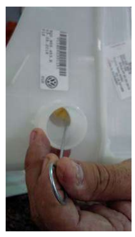
Figure 4. Cleaning the sensor probes.

4. Thoroughly clean the sensor probes (Figure 4).