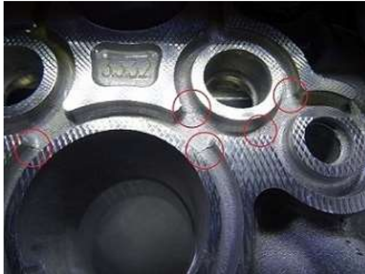
Figure 5. Before the repair.

Make sure not to damage the seal groove!