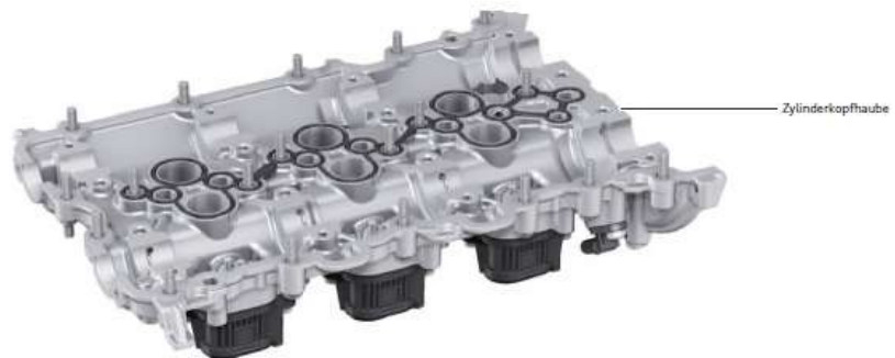
Figure 4. Remove the cylinder head cover.