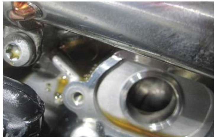
Figure 2. Oil in the Audi valvelift system.