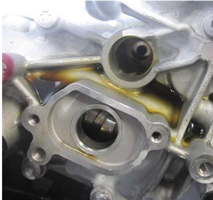
Figure 3. Locating the affected cylinder.