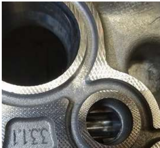
Figure 6. After the repair.