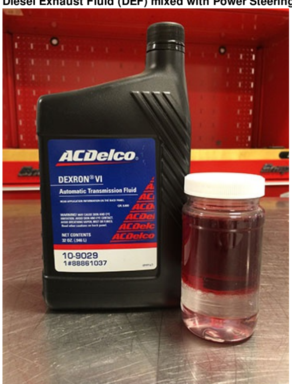
Diesel Exhaust Fluid (DEF) mixed with Transmission Fluid.