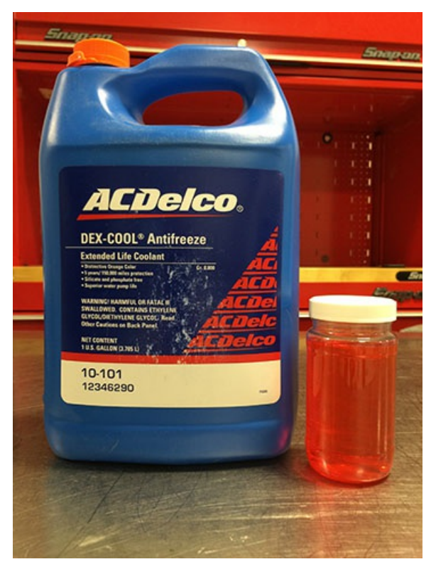
Diesel Exhaust Fluid (DEF) mixed with Dexcool.