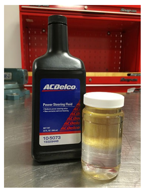
Diesel Exhaust Fluid (DEF) mixed with Power Steering Fluid.