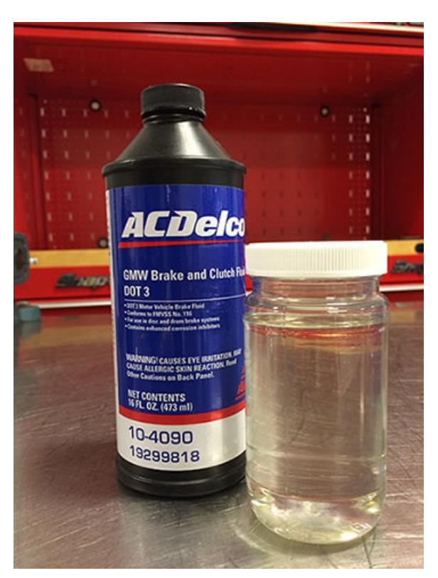
Diesel Exhaust Fluid (DEF) mixed with Brake Fluid.

During inspection of the diesel exhaust fluid (DEF) system and it's components, the dealer may find or suspect contamination. Always refer to Service Information for Contaminants in Diesel Exhaust Fluid Diagnosis and use special tools J26568 Coolant and Battery Fluid Tester or EN50422 Diesel Exhaust Fluid Refractometer for fluid testing. Below are examples of DEF mixed with different sources of contamination.