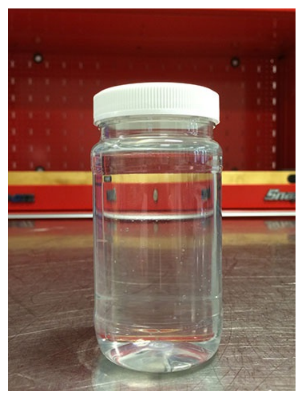
Diesel Exhaust Fluid (DEF) mixed with Water.