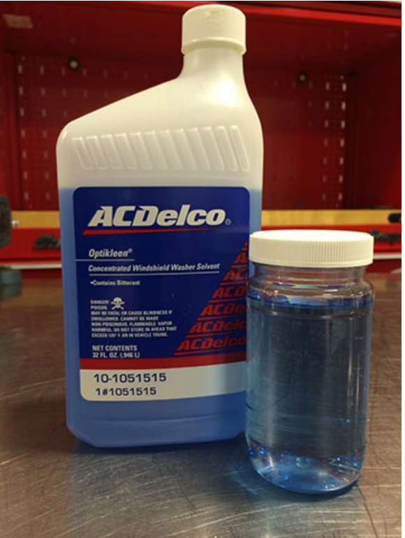
Diesel Exhaust Fluid (DEF) mixed with Windshield Washer Fluid.