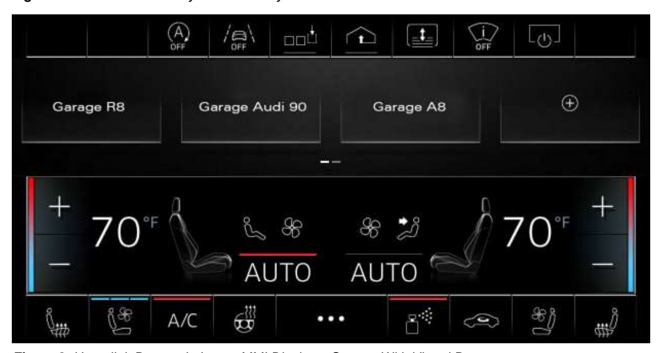
Figure 2. Homelink Buttons In Lower MMI Display – System With Virtual Buttons.