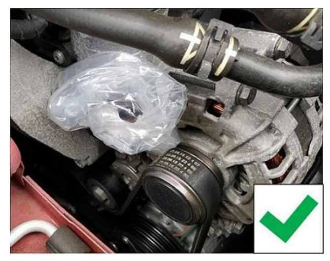
Figure 2. (Correct)