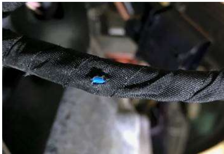
Figure 2. Example of a small rip in the protective tape.