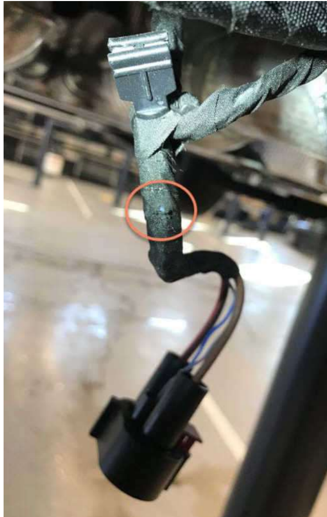
Figure 3. The damage in the harness might be difficult to spot.