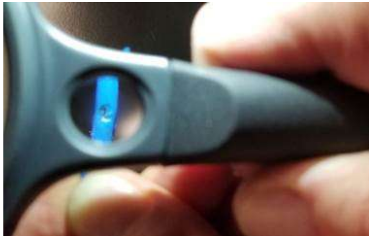
Figure 4. The cause of the DTC may be as small as a pinhole.