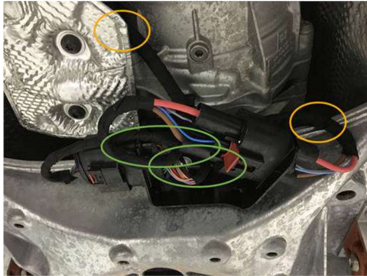
Figure 1. Common positions for harness damage.