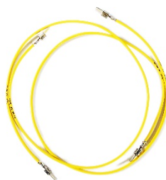
Terminal Part Number 000979226E X2