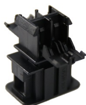
Connector Part Number 1J0972732

Dealer created Adapter Harness Required for trailer brake controller.