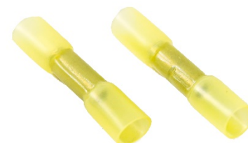
Splice Connector Part Number 000979943 X4