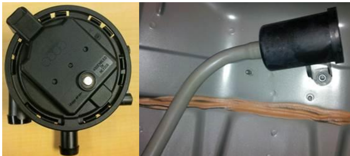
Figure 1. NVLD pressure sensor (left) and NVLD filter (right).