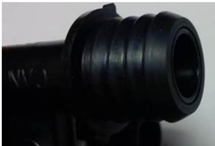
Figure 2. Align the grommet and sensor outer edges.