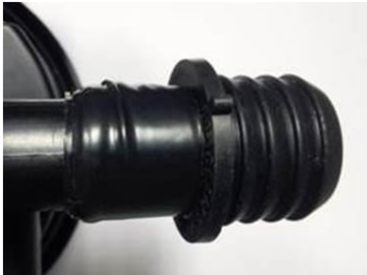
Figure 4. Vinyl layer supporting grommet.