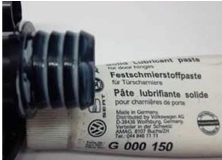
Figure 5. Grease film on the outer surface of the grommet.