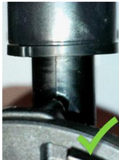
Figure 6. Correctly-installed sensor and grommet.