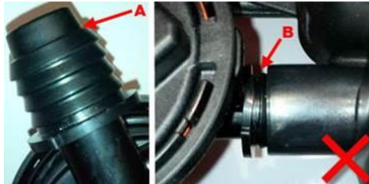
Figure 7. Plastic port extending past the grommet (A) causing installation issues (B).

7. An incorrectly-installed sensor and grommet (Figure 7) can cause an EVAP leak and repeat failures. Issues can occur when the NVLD switch is pressed too far into the canister, then pulled back out in an attempt to align the NVLD switch with the mounting holes. Do not apply any lubricant between the sensor and the grommet.