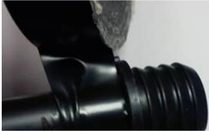
Figure 3. Wrapping vinyl tape behind the grommet.