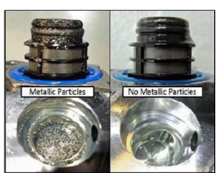
Figure 2. Surrounding Area

If debris enters the fuel system, components may be damaged.