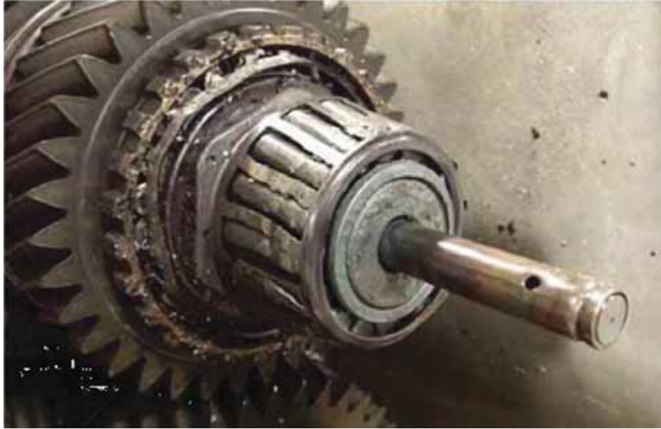
Towing Related Failure (Image 1)

Recommended Actions: Review pictures and perform instructions below