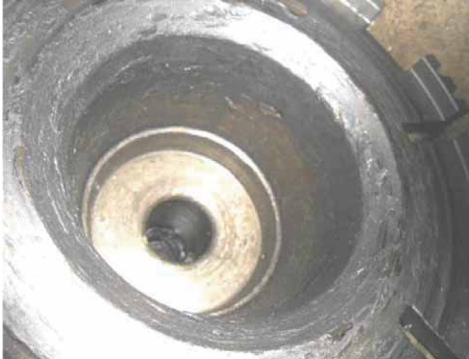
Spalled Bearing Race (Image 6)

These images (5 & 6) represent a failure that went ignored for some time.