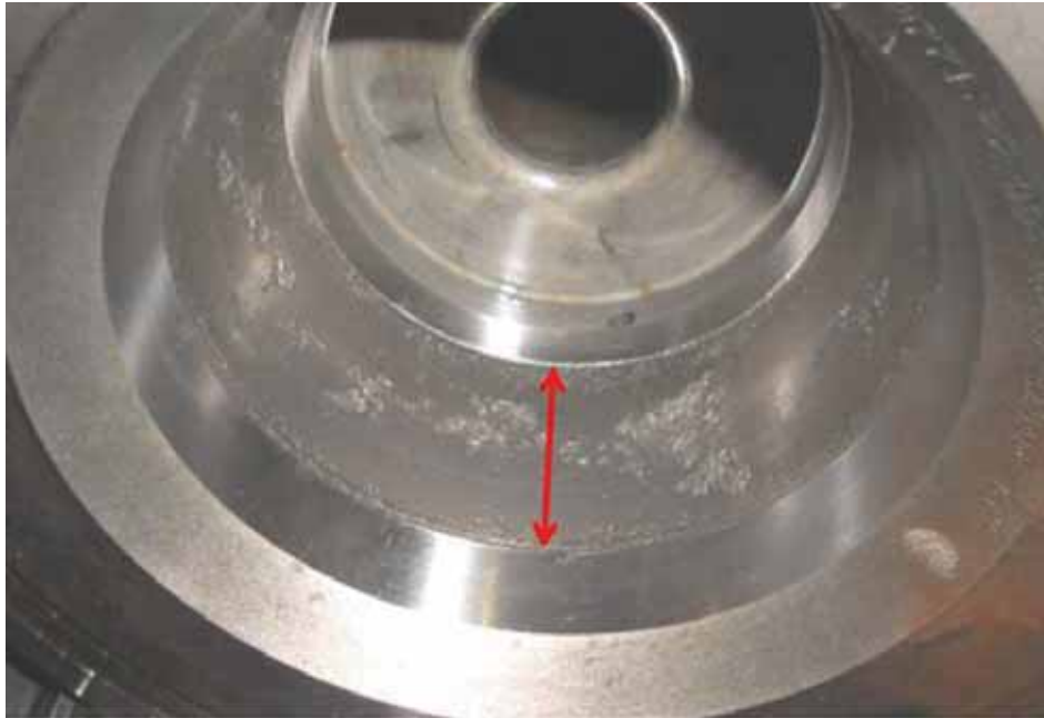
Spalled bearing race (Image 4)