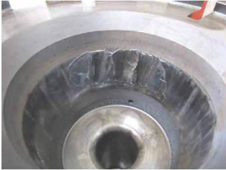
Towing Related Failure (Image 2)