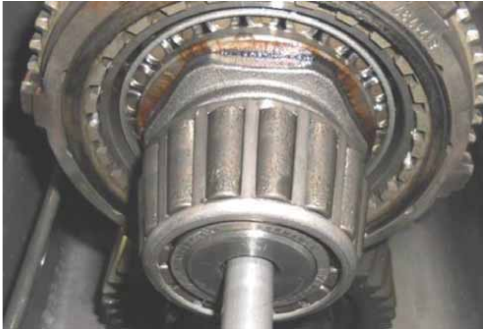
Spalled bearing failure (Image 3)