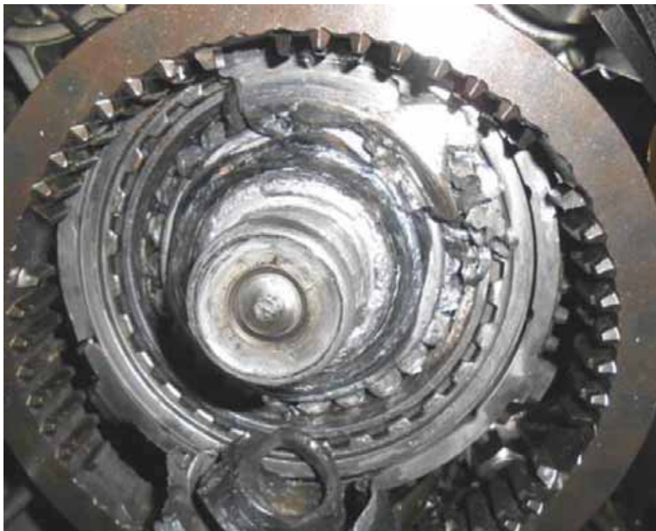
Spalled Bearing Failure (Image 5)

Reviewing DTC readout can be helpful in determining spalled vs. towing damaged spigot bearing. Main shaft speed codes prior to any towing event can indicate that the loss of main shaft pre-load may have begun before the truck was towed to the shop. This means that the bearing started to spall before the unit was towed improperly.