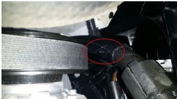
Figure 1. Point of hose contact with air conditioning compressor pulley.

A production issue with the assembly gauge used during assembly of the hose was found. This issue caused the hose to be assembled with an incorrect geometry. As a result, the lie intended