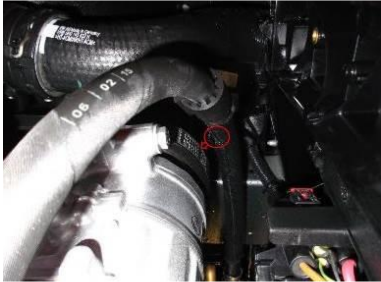
Figure 2. Point of hose contact with air conditioning compressor pulley – rear view.

to keep the hose away from the air conditioning compressor pulley was compromised.