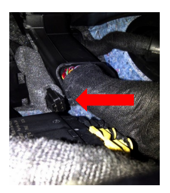
4 pin connector is wrapped in foam near the vehicle electrics module.

Actual product may be different on open market.