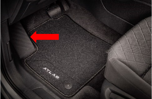
Under dead pedal on driver floor.