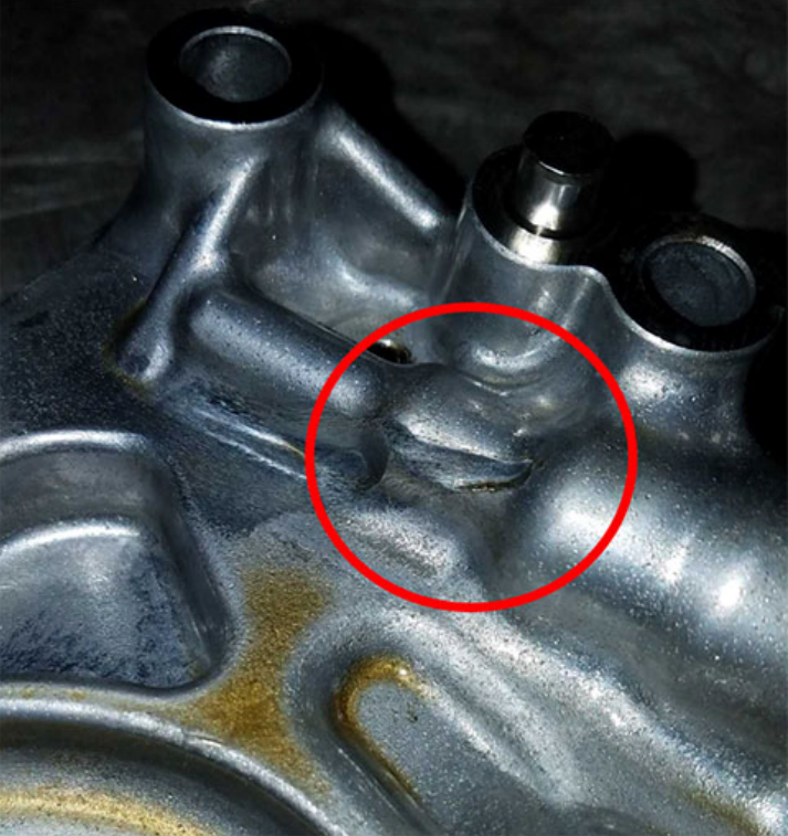
The hole in the oil pump