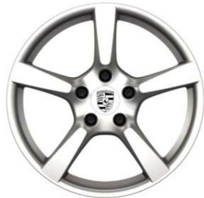
19-inch Cayman S 4

RA: 10J x 19, RO 45 Part No. 982.601.025.C_FFF