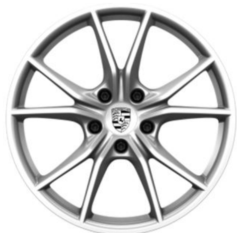
20-inch Carrera S 4

RA: 10J x 20 H2, RO 45 Part No. 982.601.025.J_FFF/ 982.601.026.B_FFF