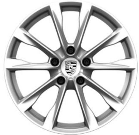
19-inch Boxster S 4

RA: 10J x 19, RO 45 Part No. 982.601.025.A_FFF