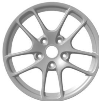
18-inch Cayman 3