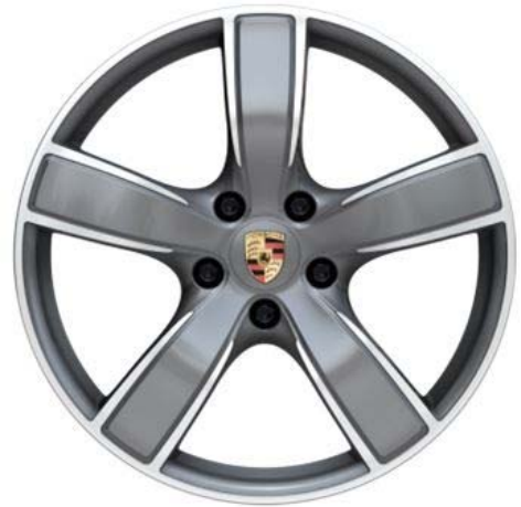
20-inch Carrera Sport

RA: 10.5J x 20, RO 47 Part No. 982.601.025.L_FFF/ 982.601.026.D_FFF