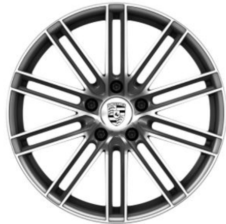
20-inch 911 Turbo 4

RA: 10.5J x 20, RO 47 Part No. 982.601.025.G_FFF