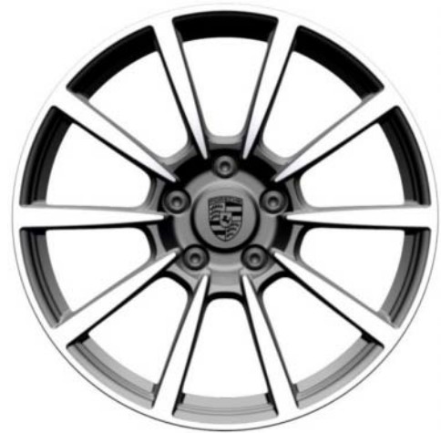
20-inch Carrera Classic 2