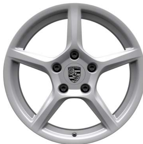
18-inch Boxster 4