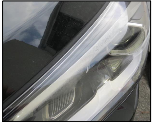
Normal condensation in the headlamp

This condensation is NORMAL and can be corrected by turning on the headlamps for approximately 30 minutes with the engine running. Repair or replacement is NOT REQUIRED.