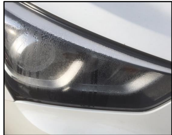
Water collecting inside the headlamp

The condition should be diagnosed and repaired as necessary.