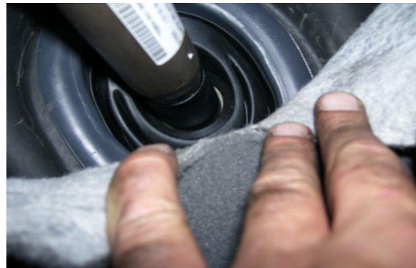
Figure 2. The sealing sleeve on the bulkhead.